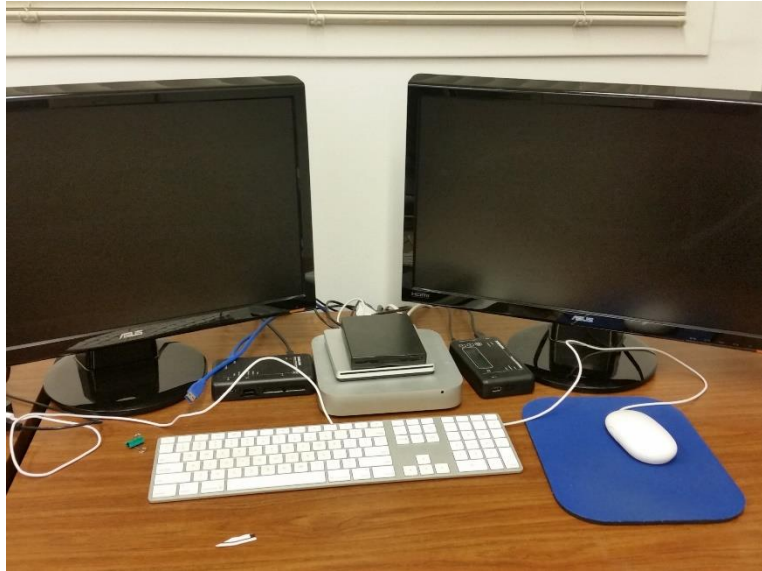
E-records processing workstation